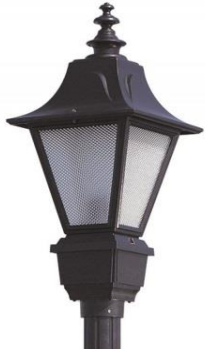
YCP LED Series