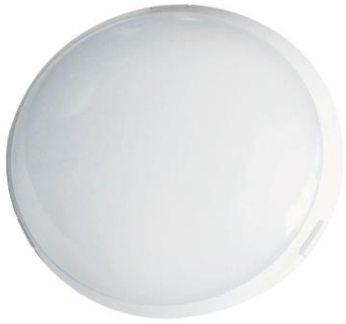
WC LED Series