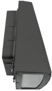
TLW LED Series