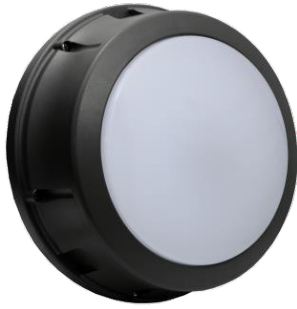
ORO LED Series