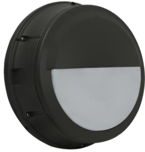
ORH LED Series