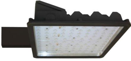
LFA LED Series