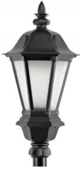
HCP LED Series