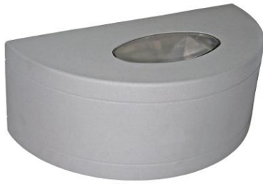
CWL Up/Down Series