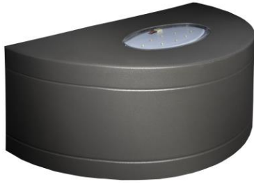
CWL Up/Down LED Series