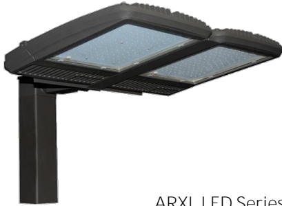
ARXL LED Series