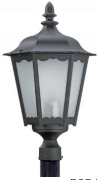
ECP LED Series