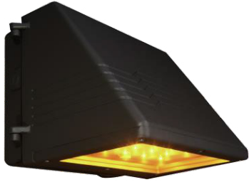
WFS Amber LED Series