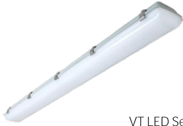
VT LED Series