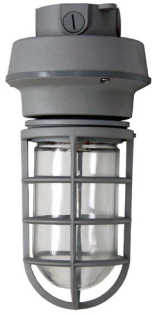
VCB LED Series