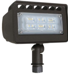
SSF LED Series