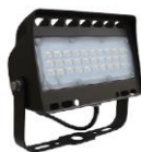
LY Large Yoke