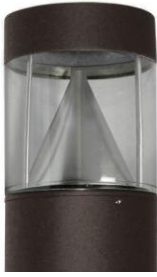
BFR Amber LED Series