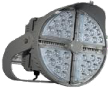
ASL LED Series