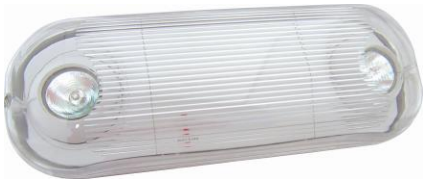
EMM WP Series