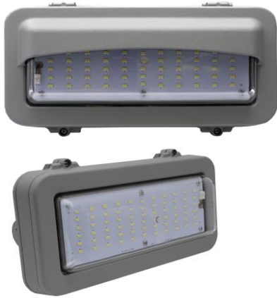
WHE LED Series