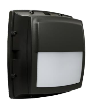
OSH LED Series