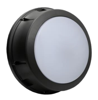
ORO LED Series