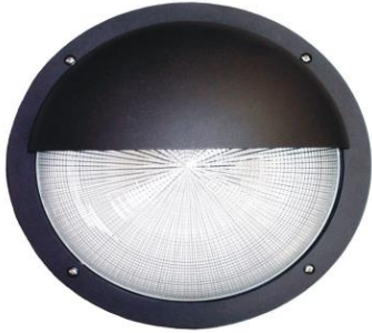
GRH LED Series