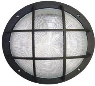
GRG LED Series