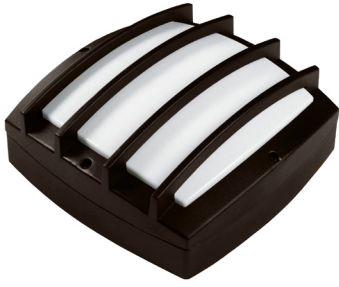
ESG LED Series