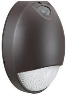
ELO LED Series