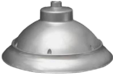
DBS LED Series