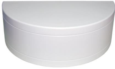
CWS LED Series