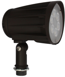
SSB LED Series