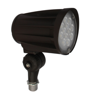
SMB LED Series