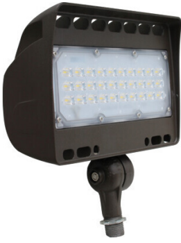
SLF LED Series