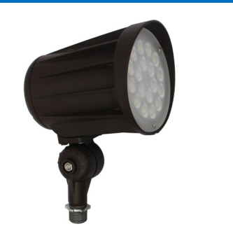
SLB LED Series