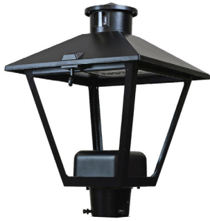
LPT LED Series