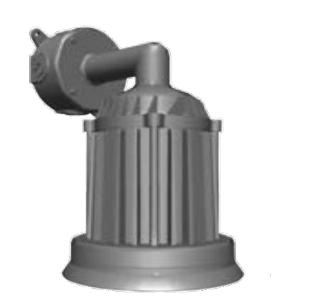
IW LED Series