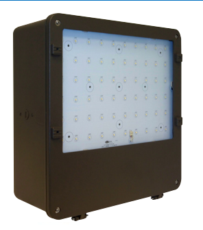
FLL LED Series