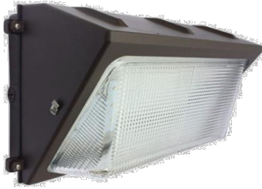
EMW LED Series