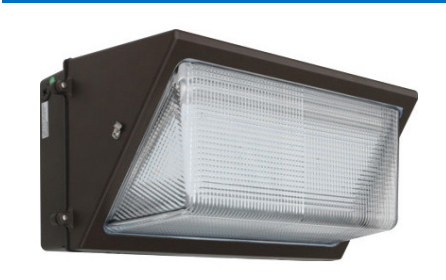
ELW LED Series