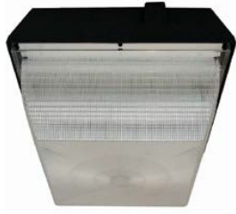
CVSM LED Series