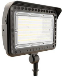
CLF LED Series