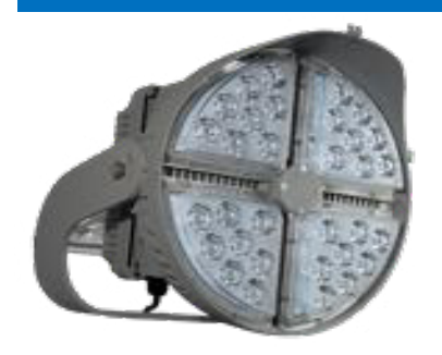
ASL LED Series