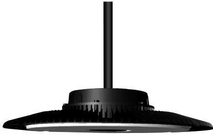
SHB LED Series