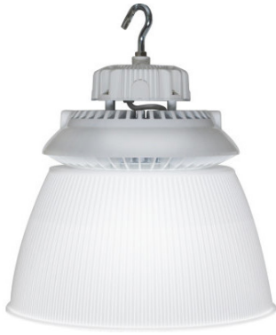
RHB LED Series