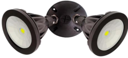
LDF LED Series